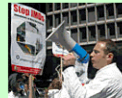
JPMorgan Chase Victory!