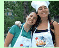
Goldman Sachs Victory!